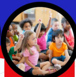
Developmentally appropriate curriculum